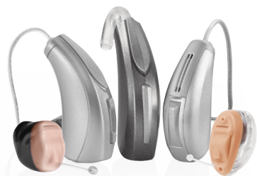
There's an iQ hearing aid that's perfect for every patient who walks through your door.

Our product lineup was designed to enhance any environment your patients frequent.