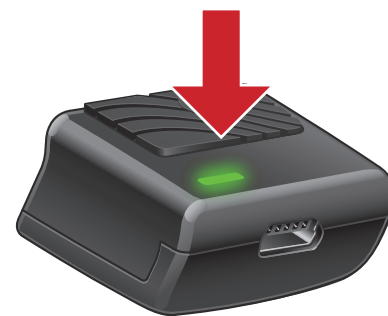
Power On (green)