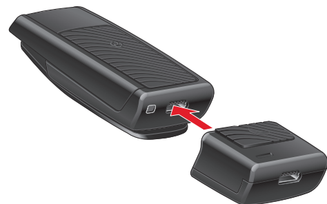
Connect SurfLink Remote Microphone 2 and SurfLink Mini Mobile