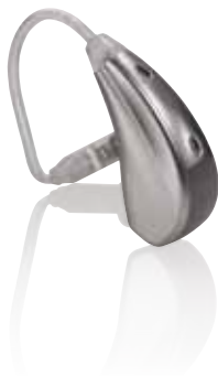
Figure 1: Image of the Multiflex Tinnitus Technology RIC hearing aid.