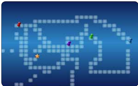
Figure 3: SoundPoint Tinnitus interface. The patient moves the mouse around the screen to explore a variety of noise stimulus settings. The pushpins represent patient-selected settings. The star represents the patient's favorite settings.

In 2011, Starkey introduced SoundPoint as a unique feature that allows a patient to fine-tune the frequency response of the hearing aids via an interactive interface within the Inspire fitting software. Multiflex Tinnitus Technology includes SoundPoint Tinnitus, which allows the patient to fine-tune the noise stimulus within a range of possible settings. As the patient explores the space on the screen via a mouse or touchscreen, the overall level and frequency shape of the noise change in real time. Figure 3 displays the SoundPoint interface. The patient can click to select settings that are desirable; these are represented by the pushpins. A patient's favorite setting is represented by a star on the screen. There may be several benefits to involving the patient in the fitting of the sound therapy stimulus. The patient has the opportunity to explore various settings for the noise and select the settings that may be most pleasant or beneficial. Additionally, allowing the patient to adjust the sound therapy stimulus directly may give the patient a sense of control over his or her tinnitus.